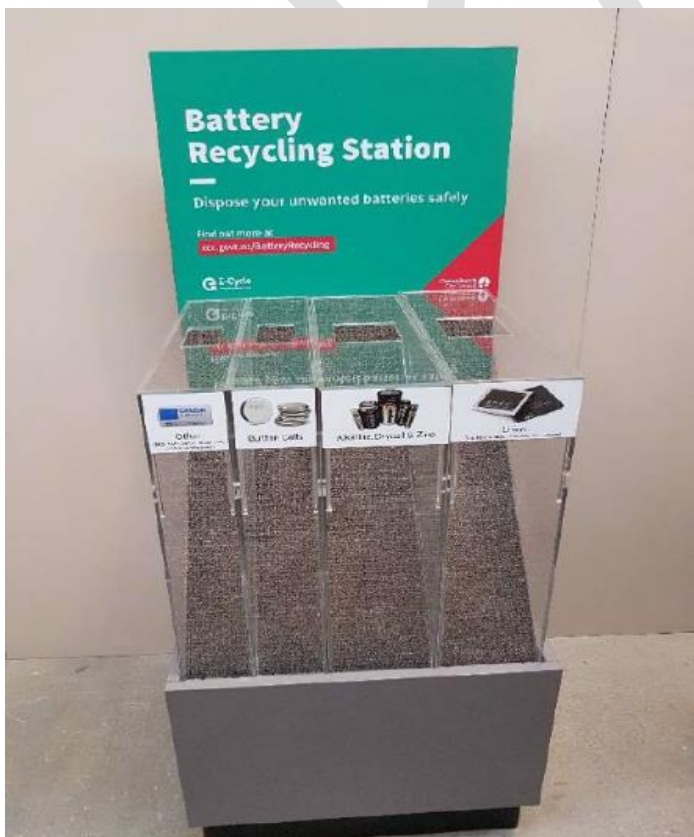
Christchurch City Council Drop-off Box

Examples: The Christchurch City Council collection trial uses an especially designed plastic (Perspex) receptacle which has four compartments for four different categories/types of batteries. However, it is advised the batteries do not need to be collected separately as the mixed chemistries provide some insulation against the fire risks of lithium-ion batteries.