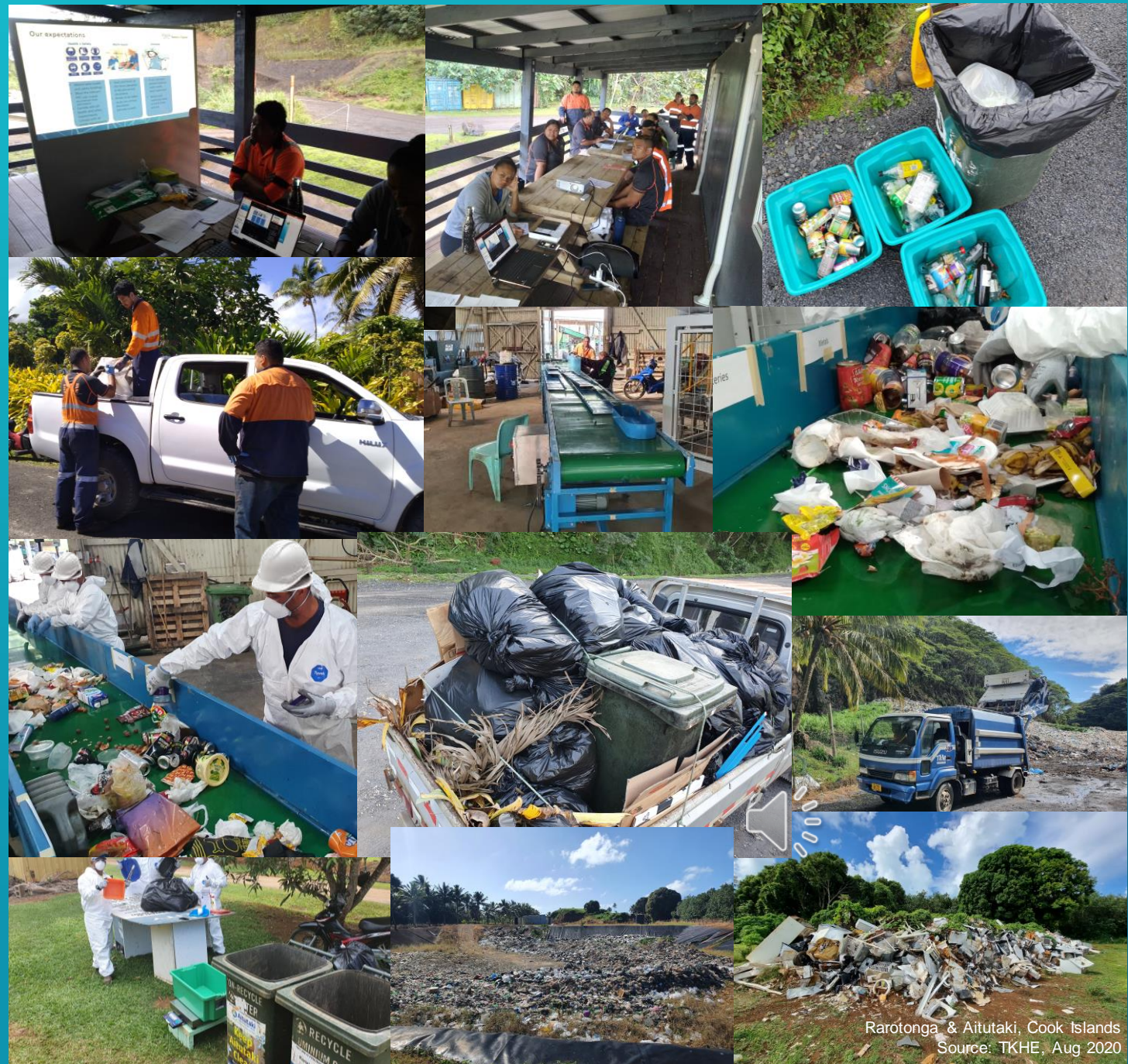
Rarotonga & Aitutaki, Cook Islands Source: TKHE, Aug 2020