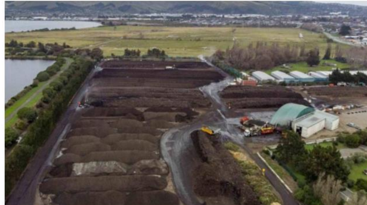
The organics processing plant site in Bromley.