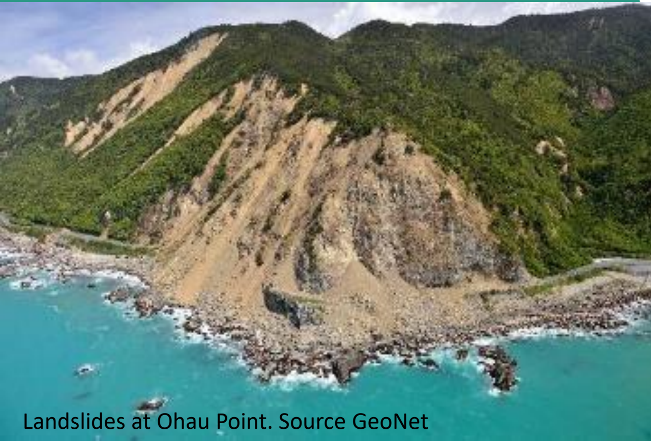
Landslides at Ohau Point.