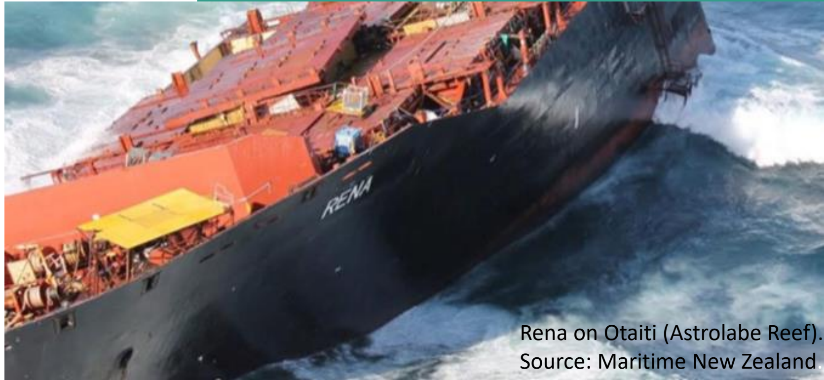
Rena on Otaiti (Astrolabe Reef).